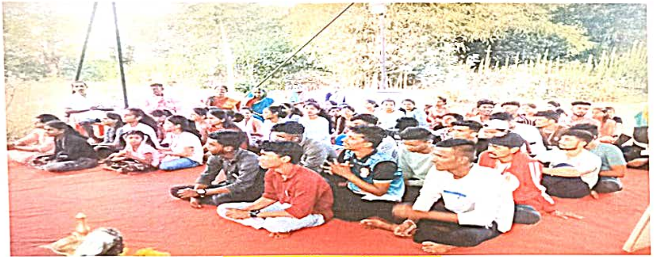
Awareness giving to village people

Wet waste and Dry waste segregation are necessary for every individual because they will help us keep our environment pollution free and also keep the environment healthy. These segregated wastes can be reused and especially plastic waste can be recycled into new products and plastic granules.