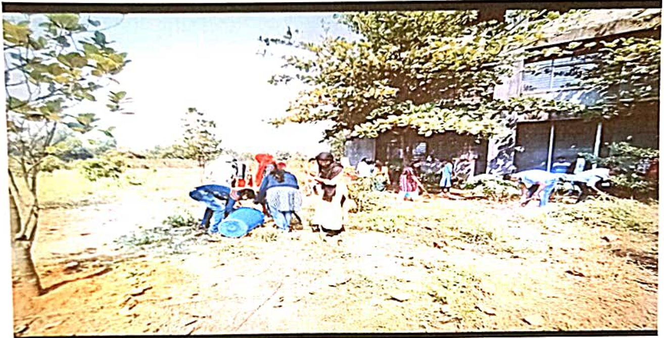
Collecting Dry and wet waste from college surrounding