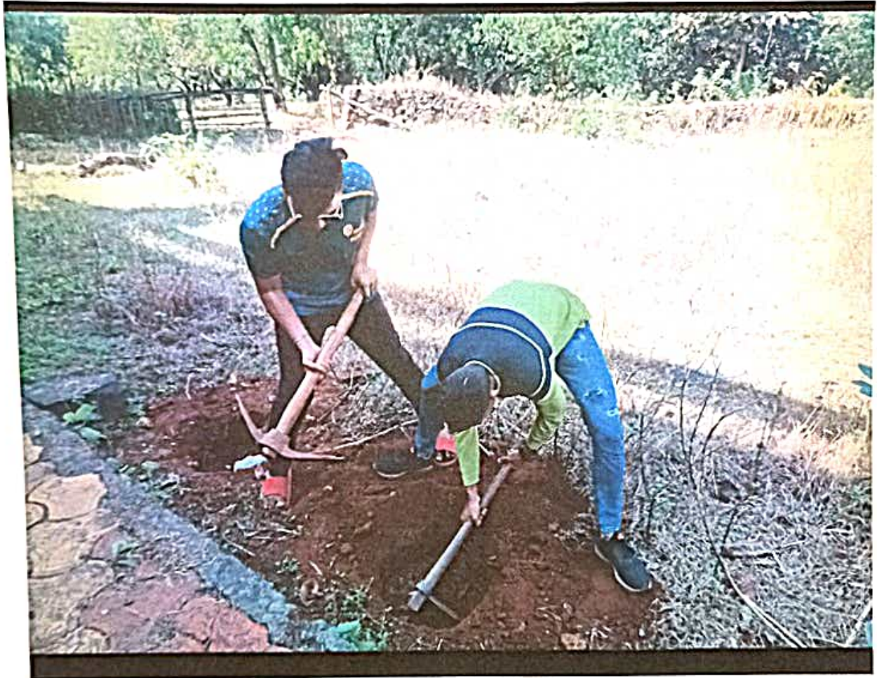
Waste dumping small puddles for wet and dry waste